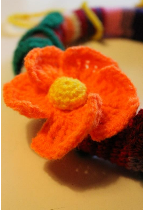
Figuur 4 And the final flower with two types of finishing