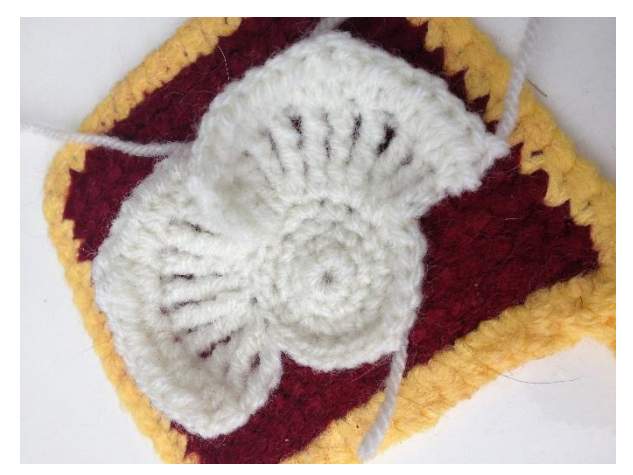
Figuur 1 Continue working petal 2 on back loop around the circle.