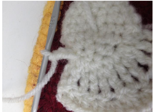
Figuur 2 For petal 2 start chaining on the back of petal 1