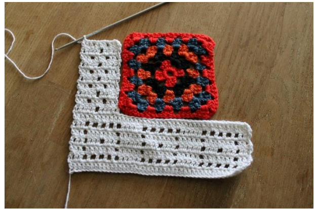
First one side, check if the granny square fits