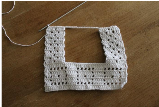
I used slip stitch + chain stitch + slip stitch to make the supporting stitches for the upper part