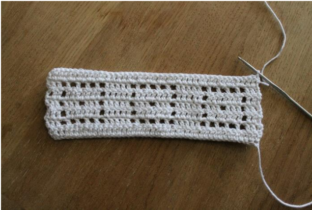
Rows 1 to 7 on the diagram

Some photos from the process of making the pockets: