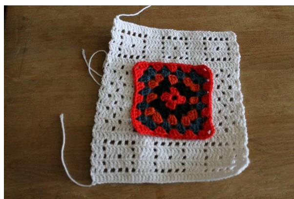
Next step after finishing the frame of the pocket: attach the granny square