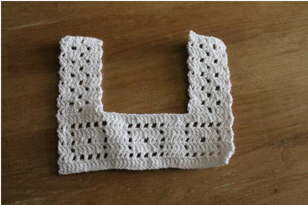
...then the other side