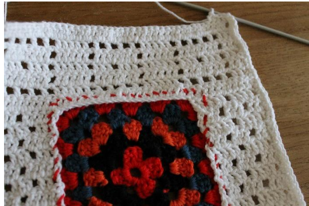
I wanted to make a pocket with some volume, so I decided to make an edge. Start by single crocheting along 3 sides on the back of the work